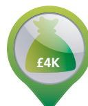
PS210 (SS1441E only)